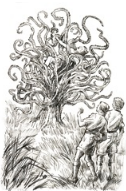
Spot the deliberate mistake

The Yateveo: A carnivorous tree once used for defense against Riffraff, but now feral so can take a respectable citizen as easily as a worthless one. Lightning quick, the Yateveo has been known to catch a deer at full speed. Victims are digested slowly in the central bulb over a period of weeks. Unpleasant.