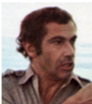
1 Roger Vadim

One of these images does not belong here. Which one is it?